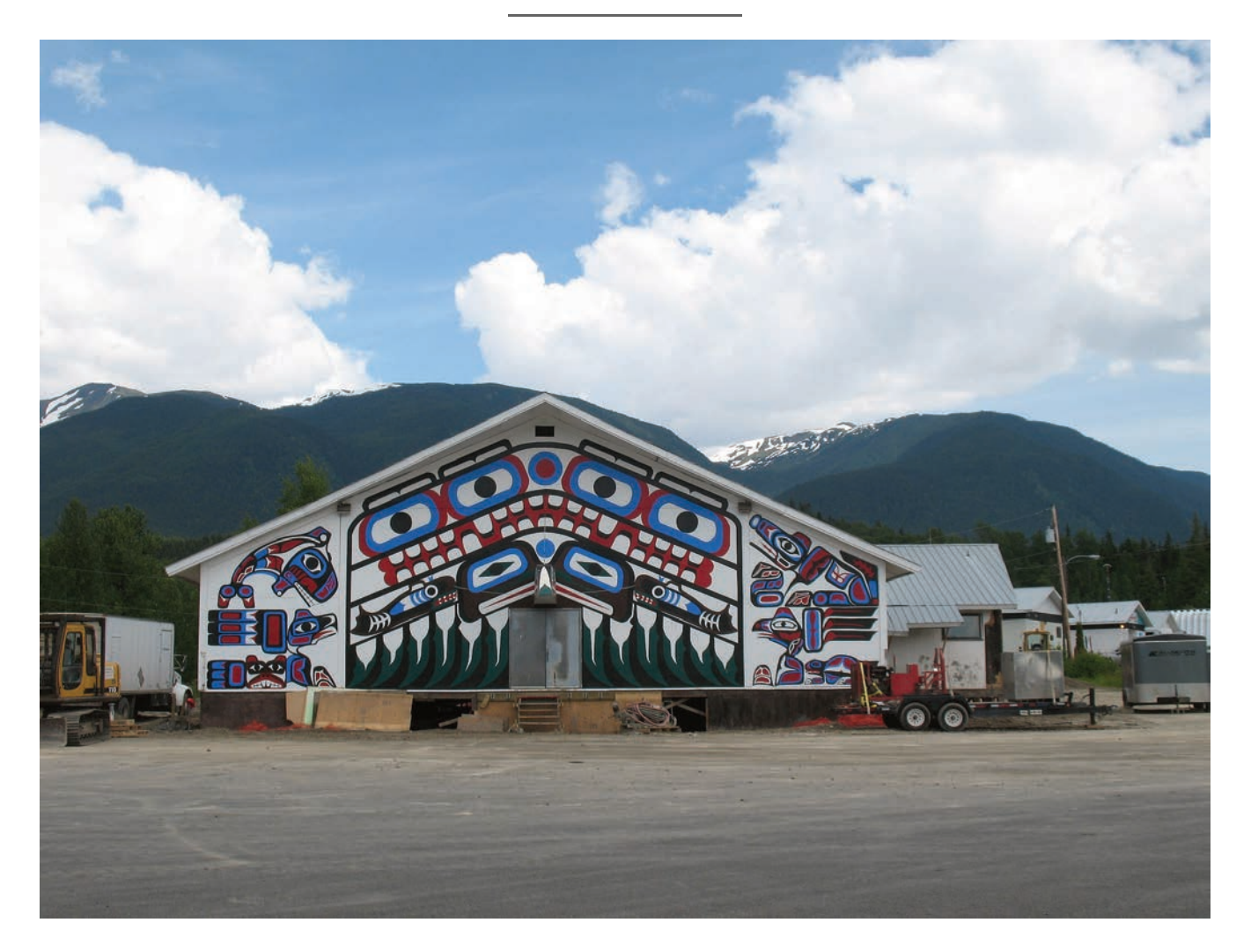
Fig 4.1: Traditional Nisga'a house in New Ayanish.