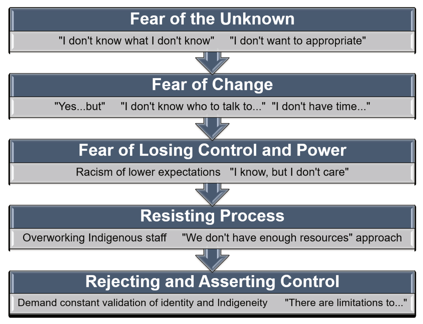
Fig 4.2: Levels of Indigenization. [Long Description]

Here are some strategies to keep in mind to help you overcome these challenges and barriers: