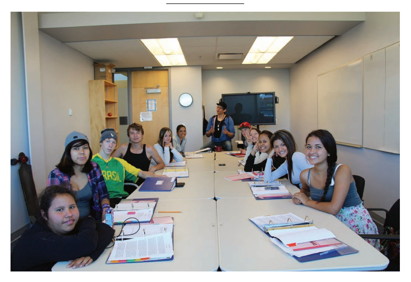
Fig 1.1: Aboriginal math/English camp.