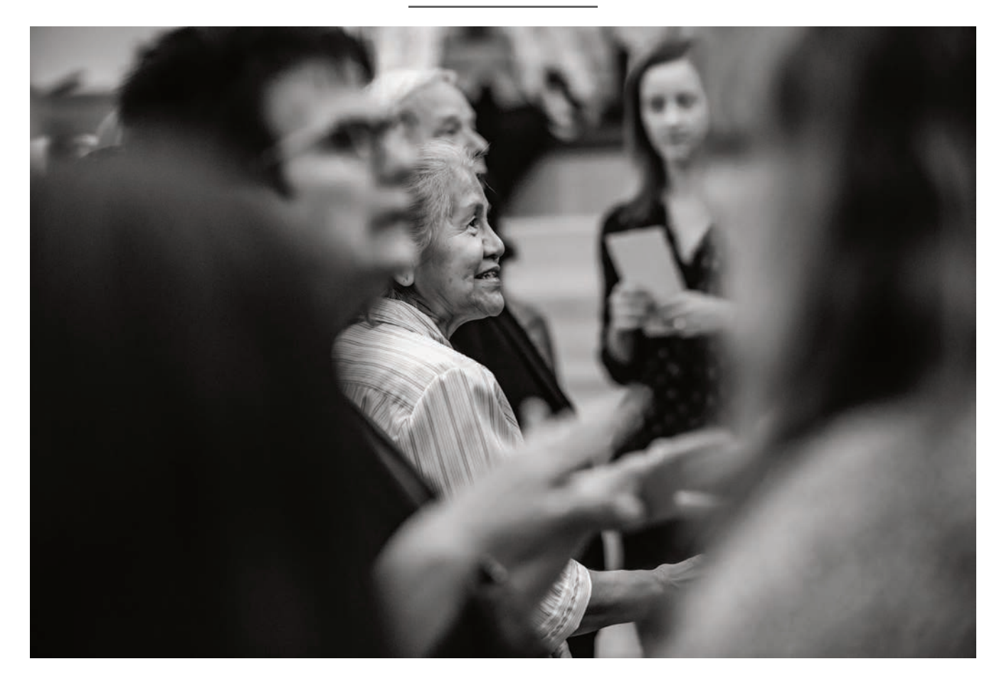
Fig 2.1: Indigenous graduate reception.